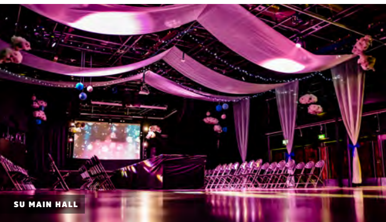
SU MAIN HALL