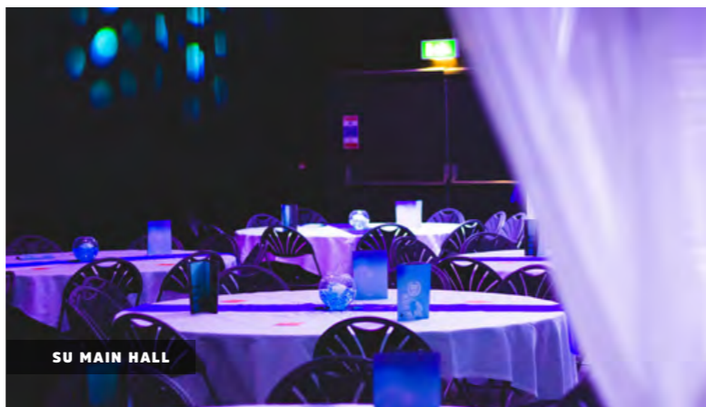
SU MAIN HALL