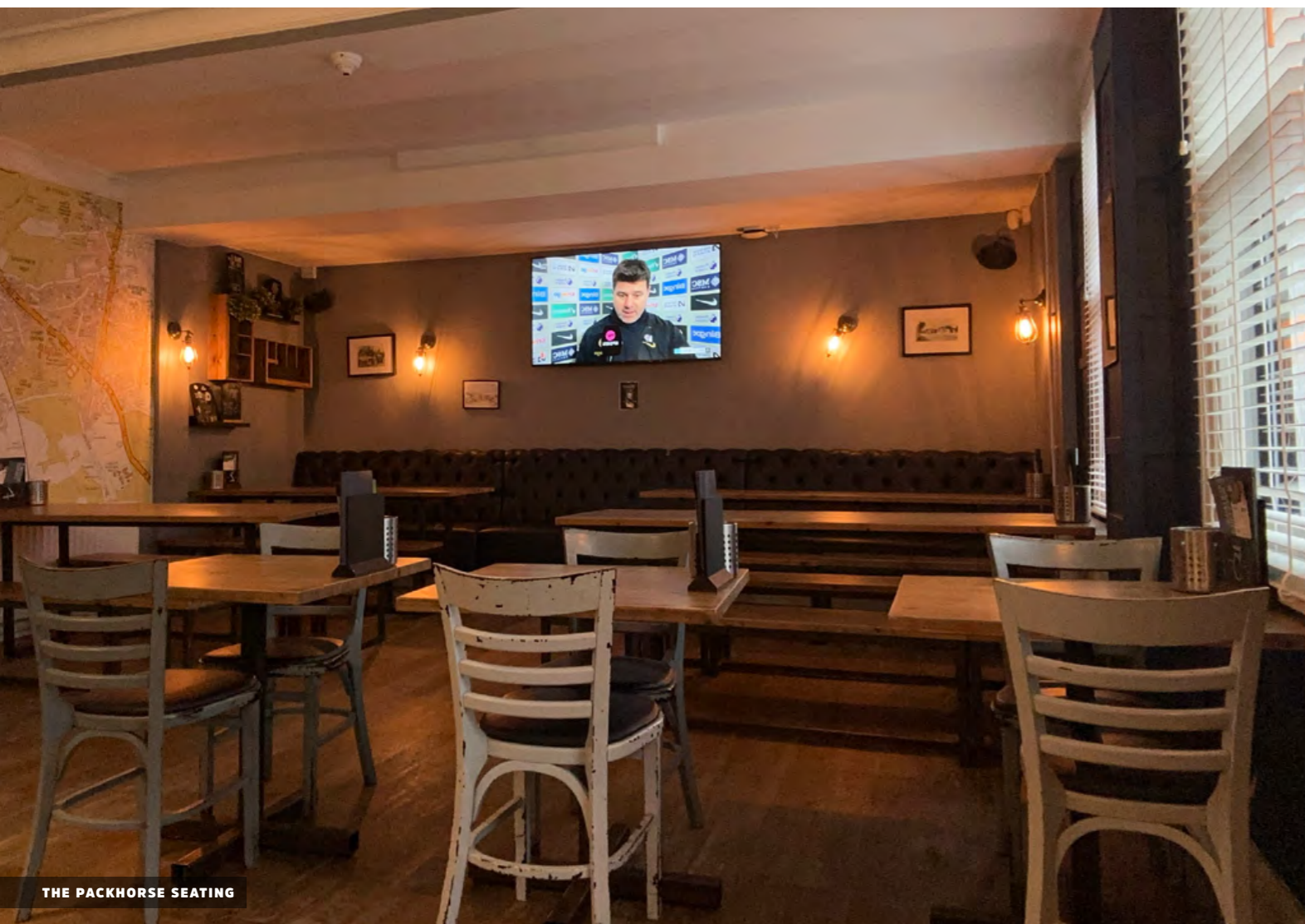
THE PACKHORSE SEATING