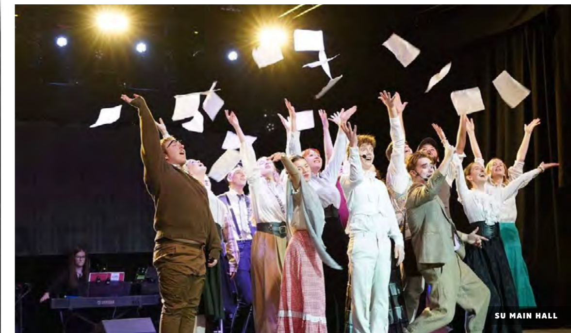
SU MAIN HALL