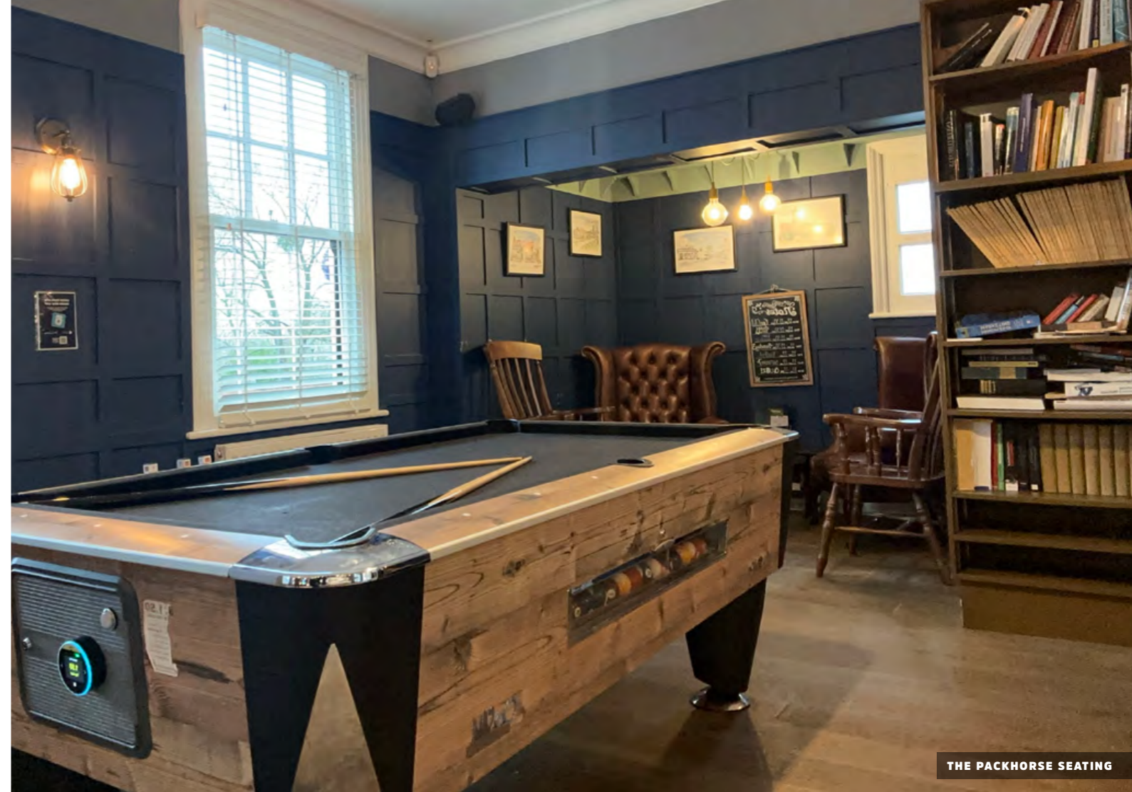
THE PACKHORSE SEATING