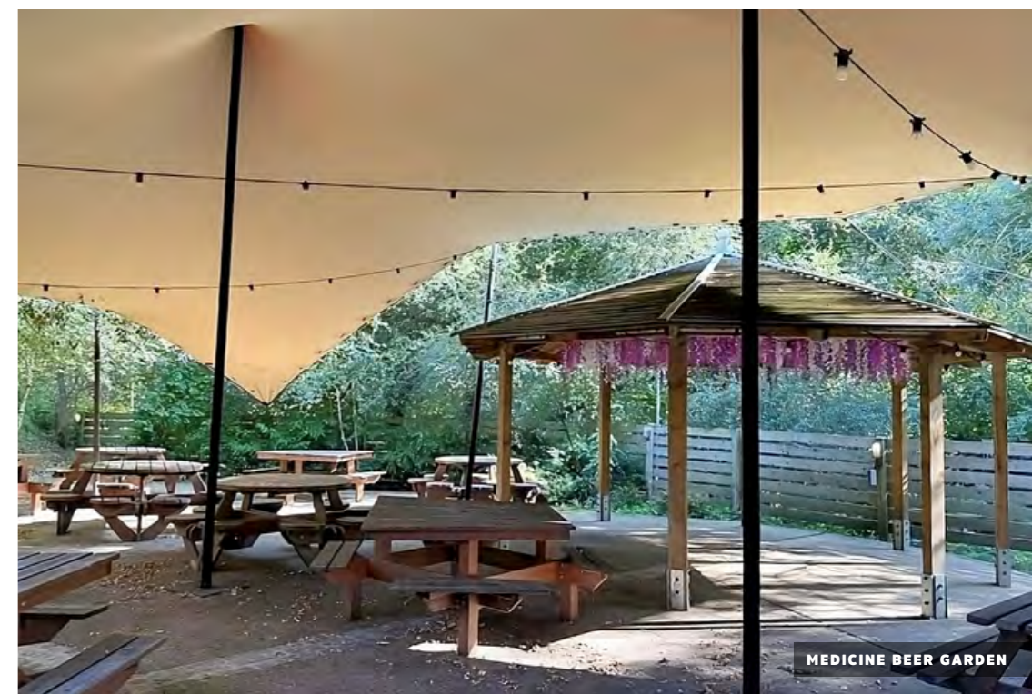
MEDICINE BEER GARDEN