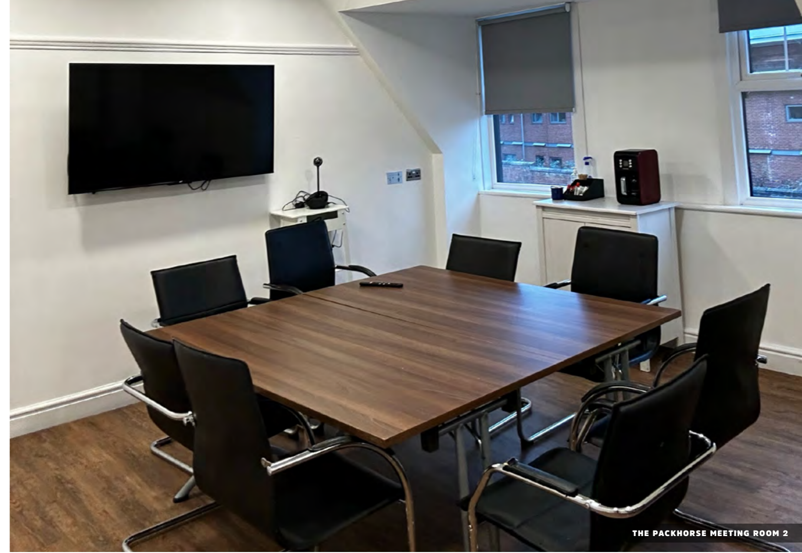
THE PACKHORSE MEETING ROOM 2

In a rush and skipped breakfast? Don't worry we'll sort that for you too.