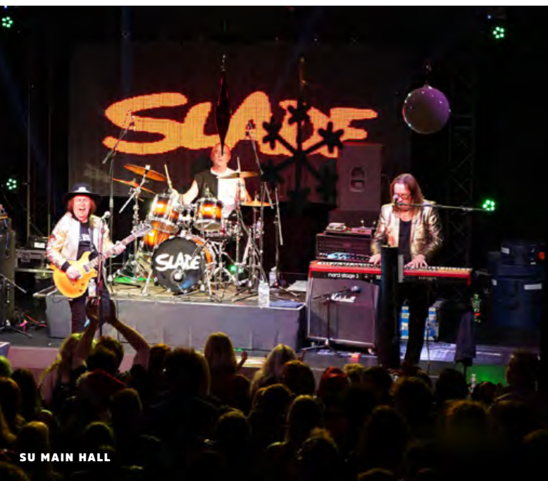
SU MAIN HALL