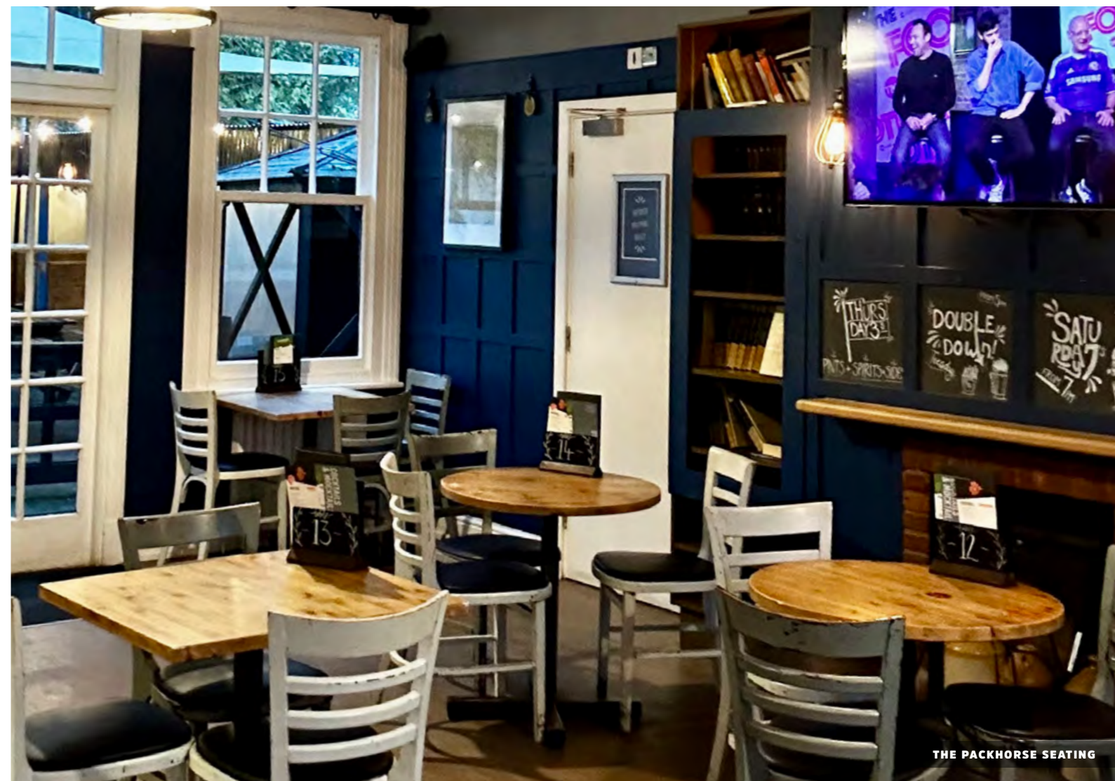
THE PACKHORSE SEATING