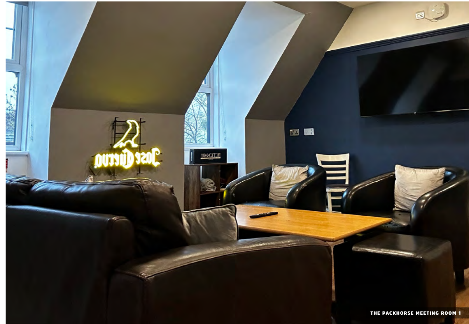
THE PACKHORSE MEETING ROOM 1