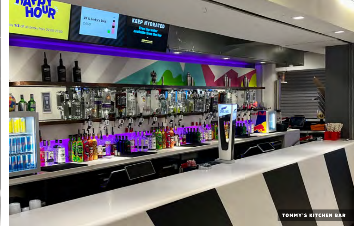
TOMMY'S KITCHEN BAR