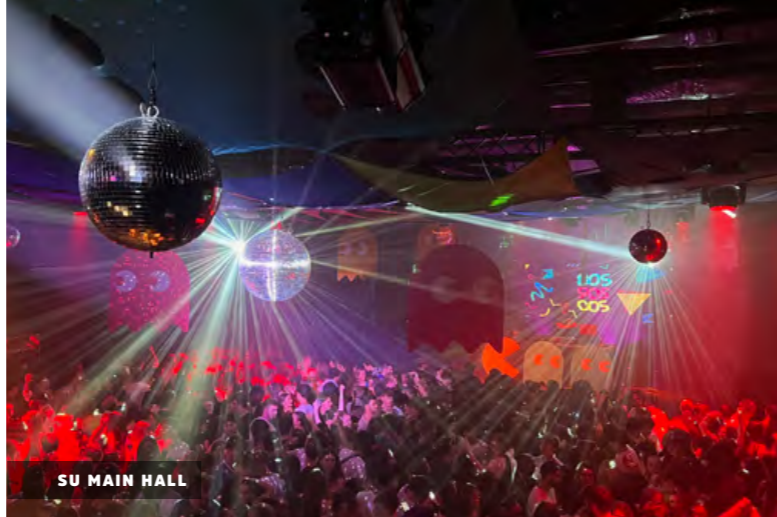
SU MAIN HALL