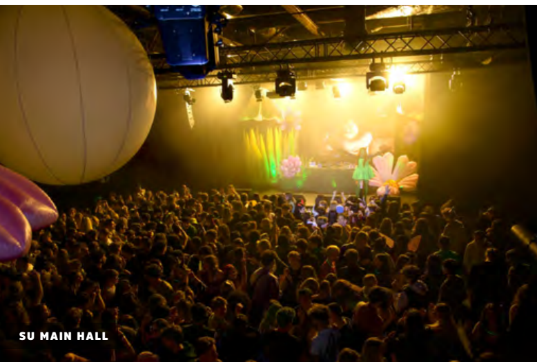
SU MAIN HALL