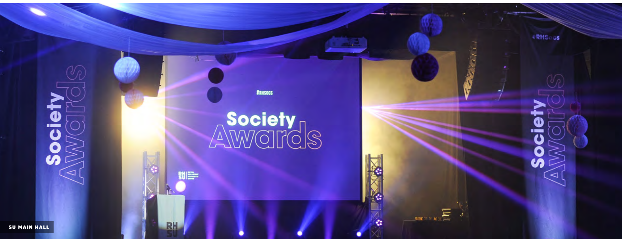
SU MAIN HALL