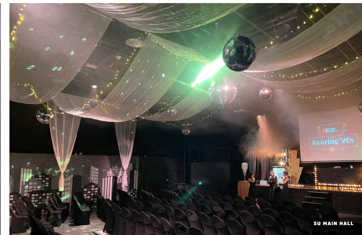
SU MAIN HALL