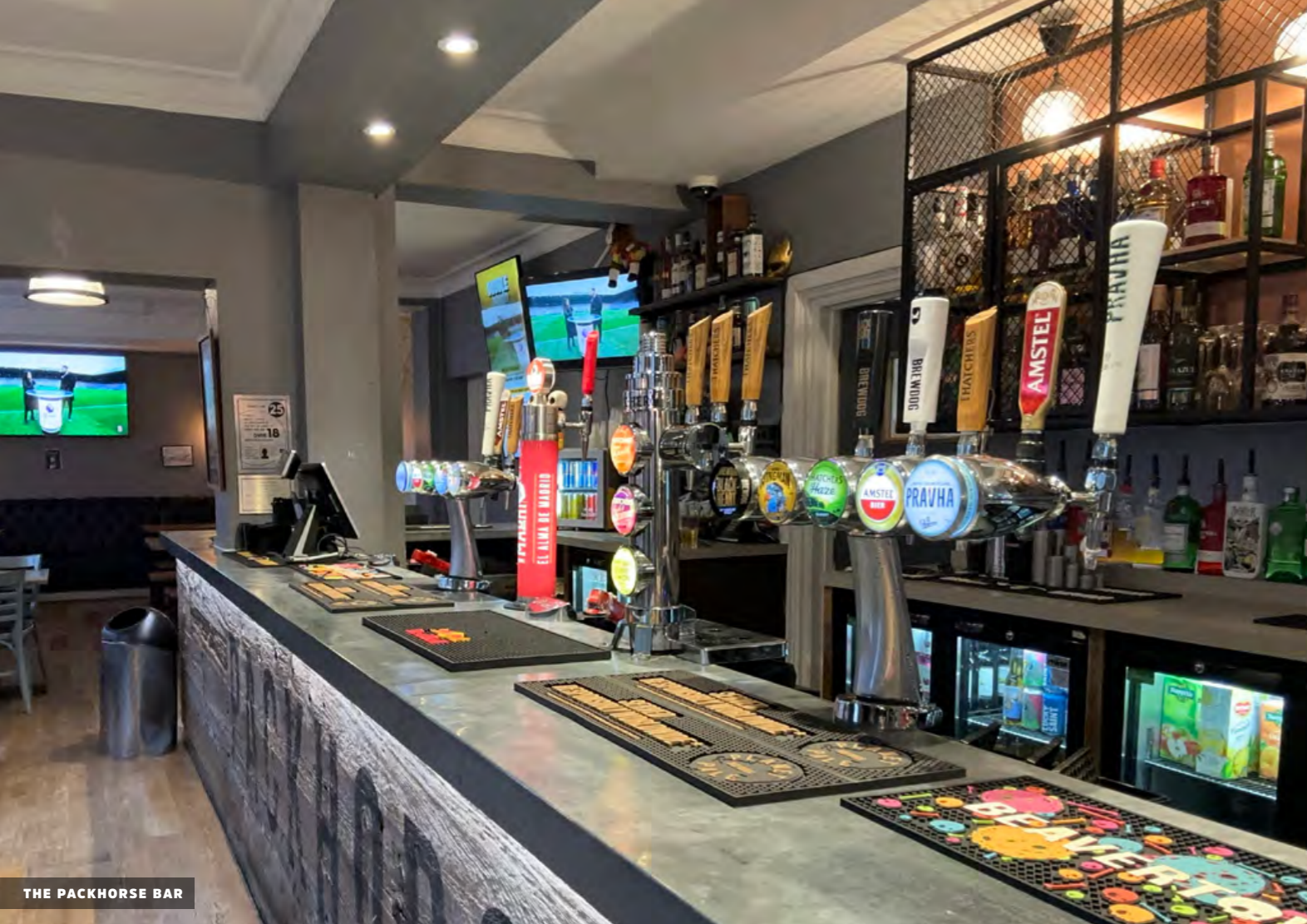
THE PACKHORSE BAR