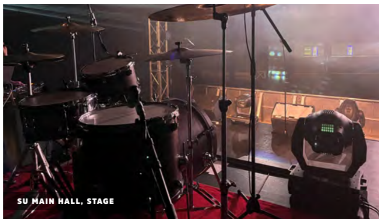
SU MAIN HALL, STAGE